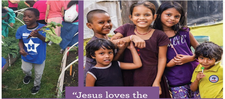
"Jesus loves the little children..."