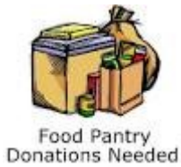
Food Pantry Donations Needed